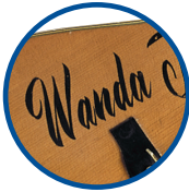
Name or Words