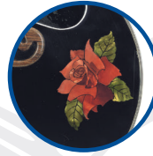
Plant or Flower