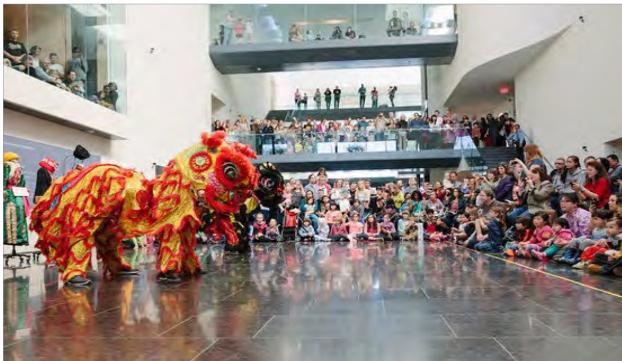
VMFA Family Day: Chinafest, 2014

E ach event is themed to a special exhibition on display or a specific culture, drawing from the museum's permanent collection of art, which spans nearly 5,000 years of world history. VMFA Family Events bring to life the study of world cultures by offering our visitors the opportunity to explore authentic works of art, create and build with hands-on art making activities, and view and participate in live performances of music, dance, and theater. Programming for each event is grounded in Virginia's Standards of Learning: pre-K-12. This tie promotes general learning and reinforces lessons taught in the classroom.