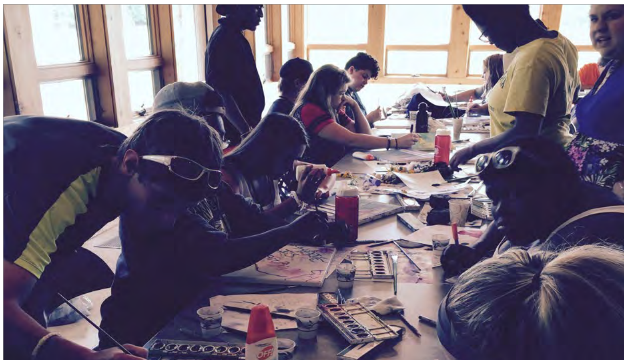
Youth from Achieving Maximum Potential, Summer 2015.

T he Des Moines Art Center's community outreach program is a partnership between health and human service organizations and schools to provide art education and healing to underserved youth. The goal of the program is to provide impactful art education within our community by using art education to inspire youth to acknowledge their unique identities and use artistic expression to overcome adversity and establish a sense of self-worth. Each student's background and identity is unique, however all have struggled in some capacity: some have suffered from abuse and/or poverty; some are homeless or are refugees; and many have learning disabilities. In addition, all of the participants suffer from low self-esteem, apathy, and/or behavioral problems. Due to their circumstances they are left struggling to achieve academic success and stability in life.