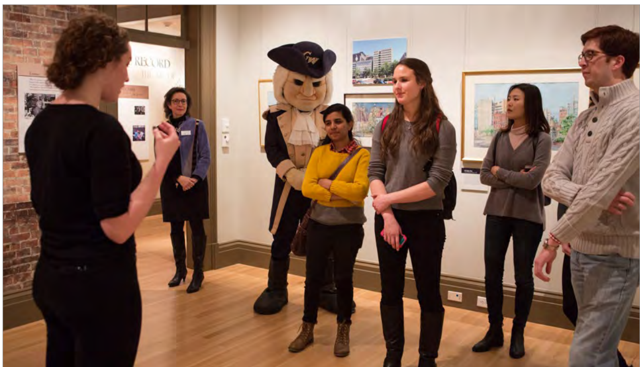
George, the university mascot, joins a Student Corps tour at the “GW Loves DC” Student Night event.