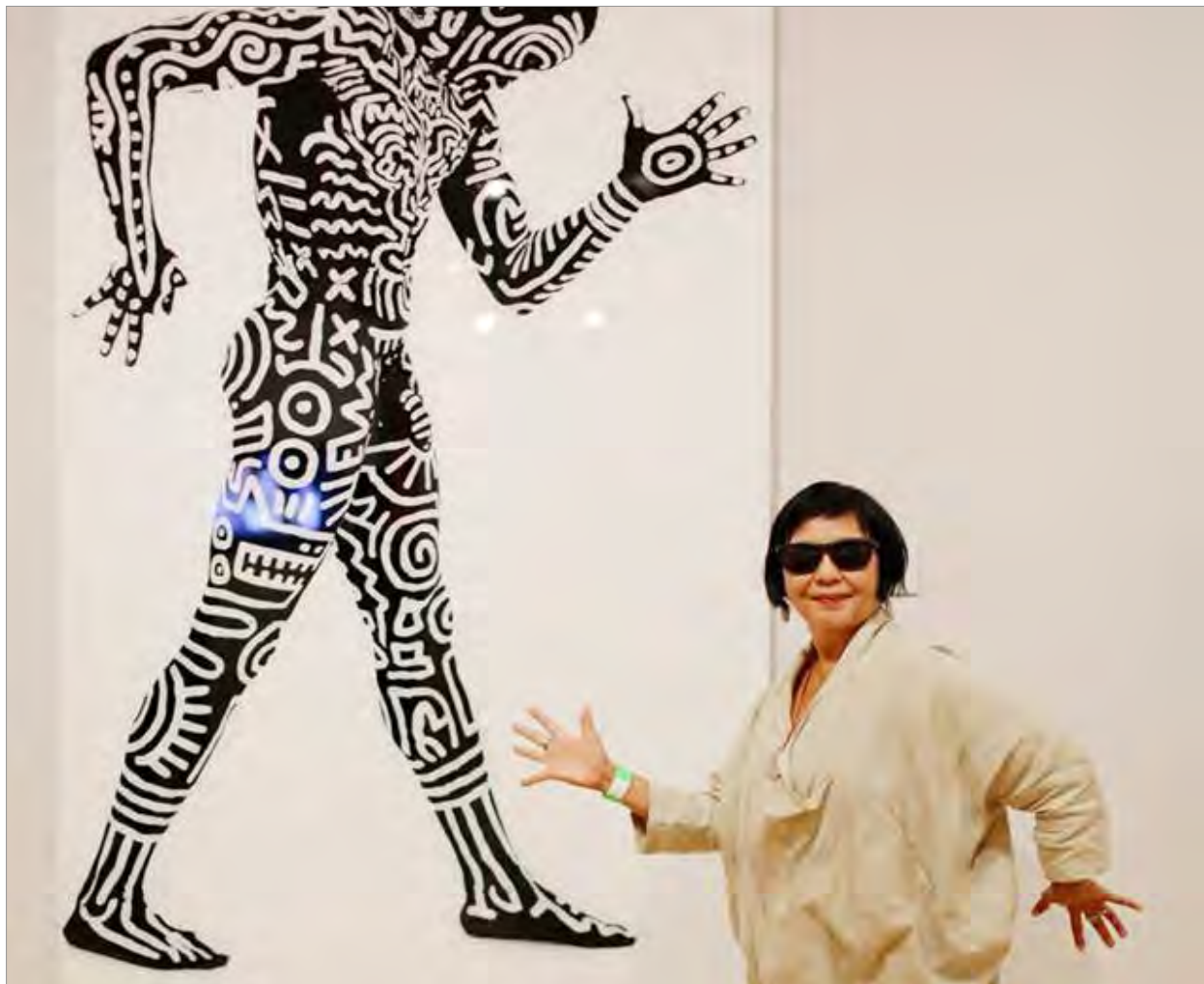
Elise Theuer for the Chrysler Museum of Art

T seng Kwong Chi: Performing for the Camera opened at the Chrysler Museum of Art with a celebration bash attended by more than 1,000 people. Hampton Roads Pride and Hampton Roads Business OutReach, two organizations dedicated to serving the LGBT community in Hampton Roads, sponsored the free opening party to help the museum promote the exhibition. The organizations were inspired by Tseng Kwong Chi's exploration of identity politics and examination of the AIDS crisis. Their support of the exhibition represents their commitment to the community and investment in the Chrysler, while the museum's partnership with these groups shows the museum's growing effort to create an environment where diversity and inclusion are valued and prioritized.