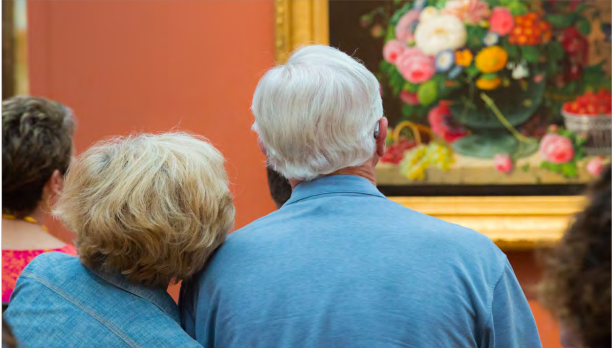
Visitors participating in the Portland Art Museum's artNOW program.