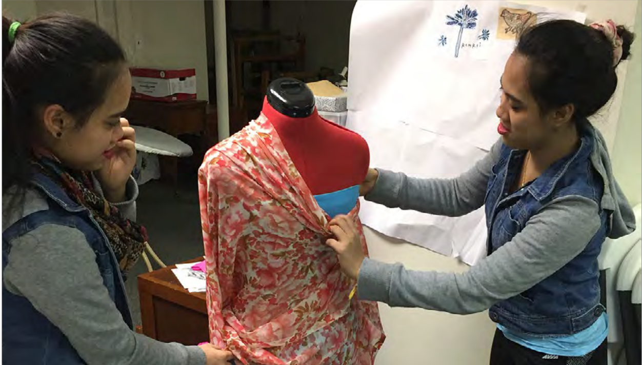
New American teens in Joslyn's Refugee Fashion Art Program preparing their looks for the Omaha Fashion Week runway.

J oslyn Art Museum's Refugee Fashion Arts Program creates the context for teen refugees to explore original fashion and textile designs under the guidance of a professional fashion artist mentor. In partnership with Omaha's Refugee Empowerment Center, Joslyn's weekly fashion arts program gives teen refugees textile-based instruction that focuses on developing technical skills and exploring different ways to actualize creative ideas. After 12 to 16 weeks of practice, the program culminates in a runway fashion show in collaboration with Omaha Fashion Week, providing teen designers with the professional experience of working with models, stylists, and photographers, and exhibiting on a catwalk.