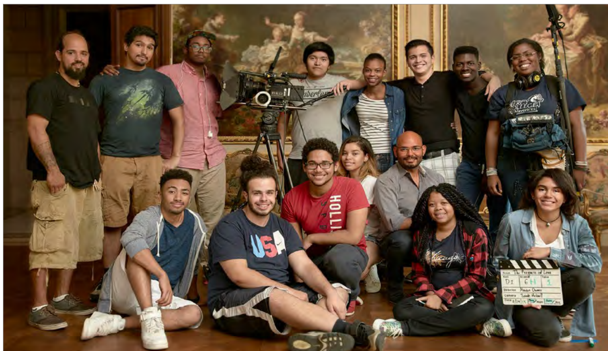
Honor students from The Cinema School at The Frick Collection.