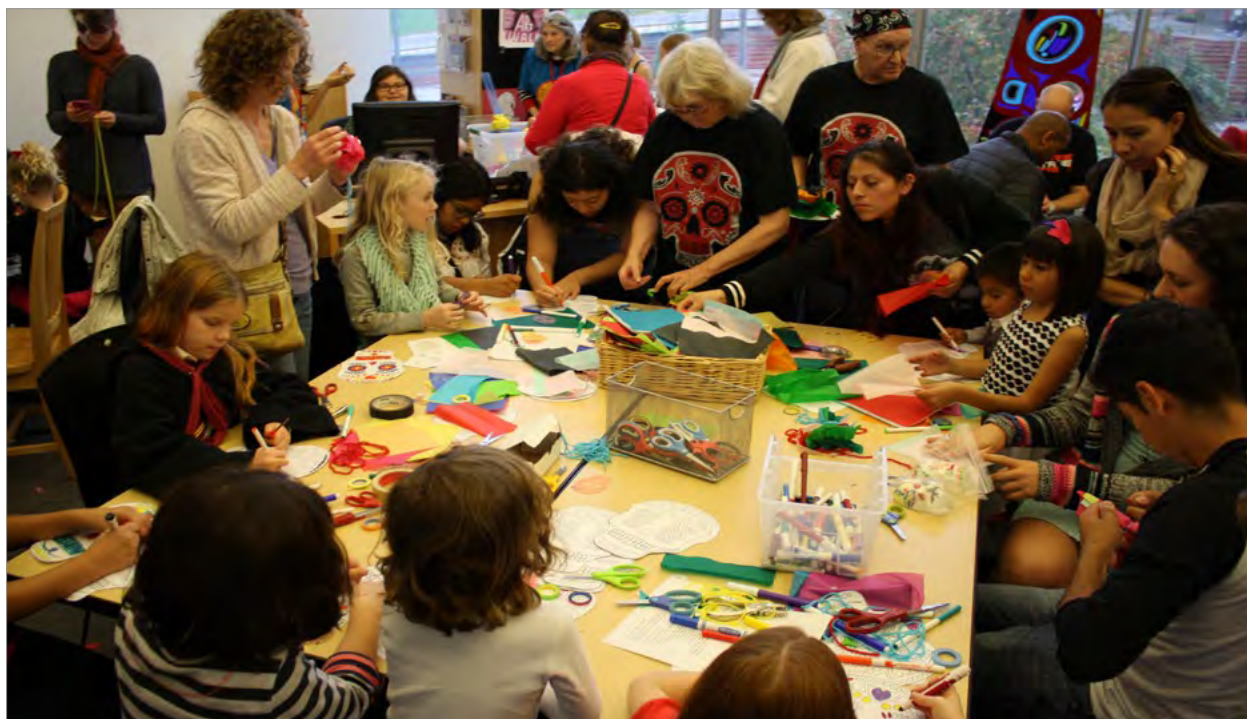
Visitors contribute to the festival by creating colorful and personal memorials to hang from the Tacoma Art Museum atrium.

T acoma Art Museum (TAM) hosts Dia de los Muertos in collaboration with longstanding community partners Centro Latino, Proyecto MoLE, and the Mexican Consulate of Seattle, a program that is now in its twelfth year. The program has two goals: to celebrate and highlight Latino American arts and culture and to educate the public about the symbolism and cultural meaning behind Dia de los Muertos.