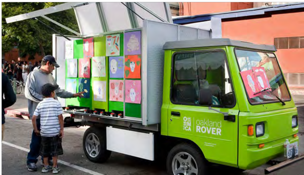
The Oakland Rover in action as part of the OMCA Connections Program.