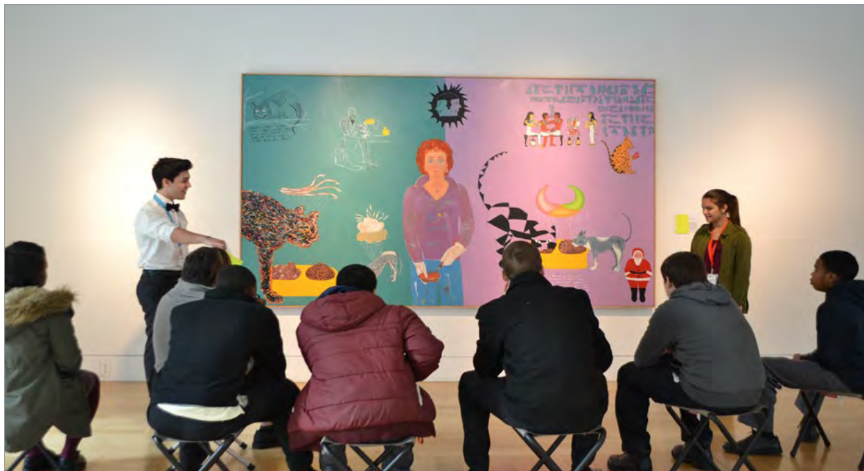
Student Docents giving a tour to their classmates at the Pennsylvania Academy of the Fine Arts.