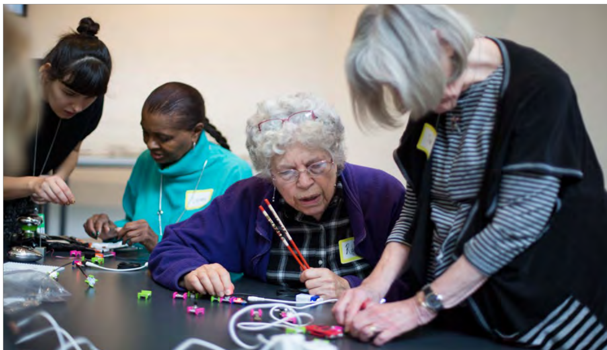
Prime Time participants redesign everyday objects in MoMA Studio: Design Interactions, November 2015.

P rime Time is a multi-year research and development project that aims to re-think how museums and cultural institutions can support a fulfilling aging process—one defined by creativity, curiosity, connectedness, and continued growth. Through Prime Time, The Museum of Modern Art (MoMA) hopes to develop a nuanced conversation that illuminates the various roles that older adults play in maintaining a vibrant and relevant cultural institution. In addition, the museum aims to examine the unique contributions that museums and cultural institutions can make to support older adult audiences.