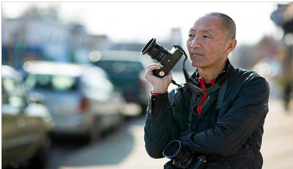
Photographer Wing Young Huie.