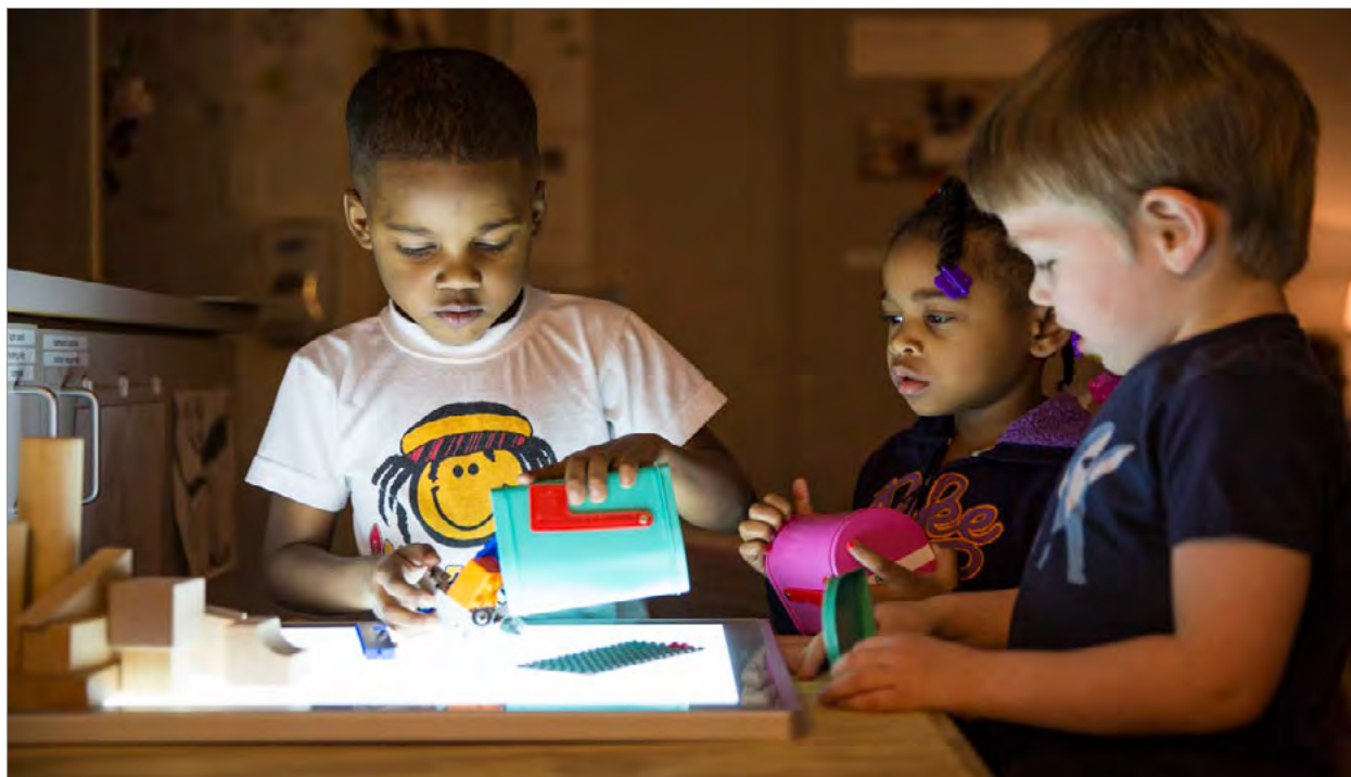
St. Mary's Child Center at the Indianapolis Museum of Art Preschool.