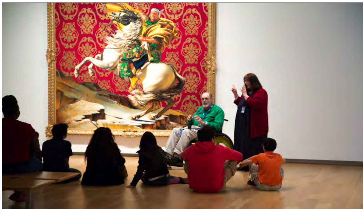
Modern Interpretations docent and interpreter teach from Kehinde Wiley: A New Republic .