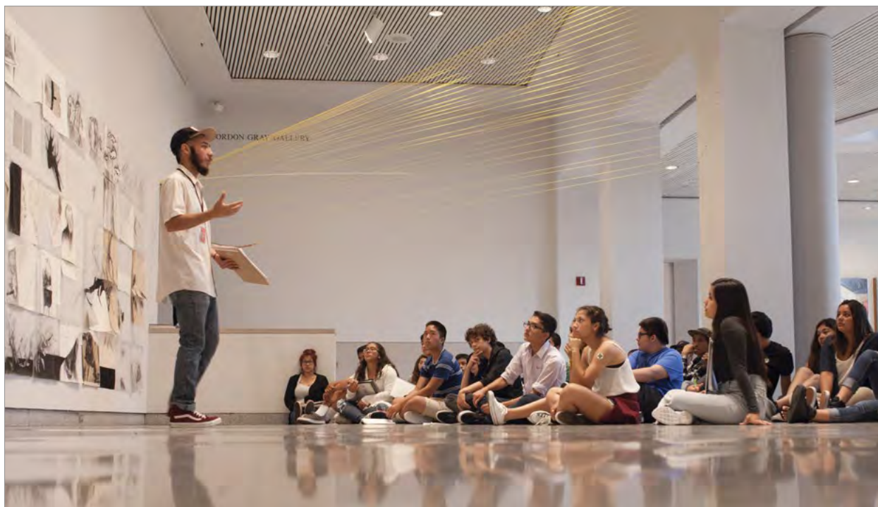
A museum educator teaches students from San Diego's Hilltop High School about the Museum of Contemporary Art San Diego's current exhibitions as part of the Museum's Extended School Partnership program.