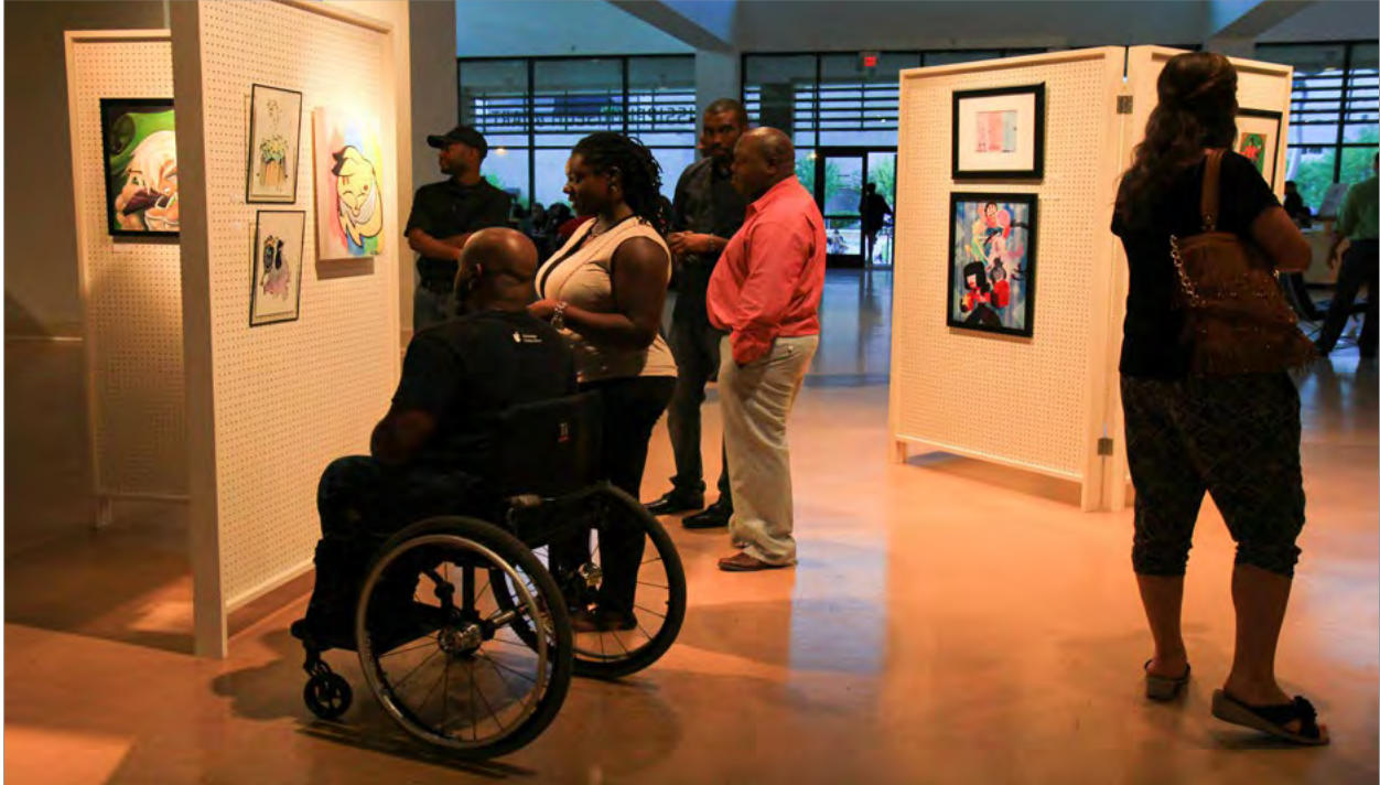
Third Thursday Museum After Hours.