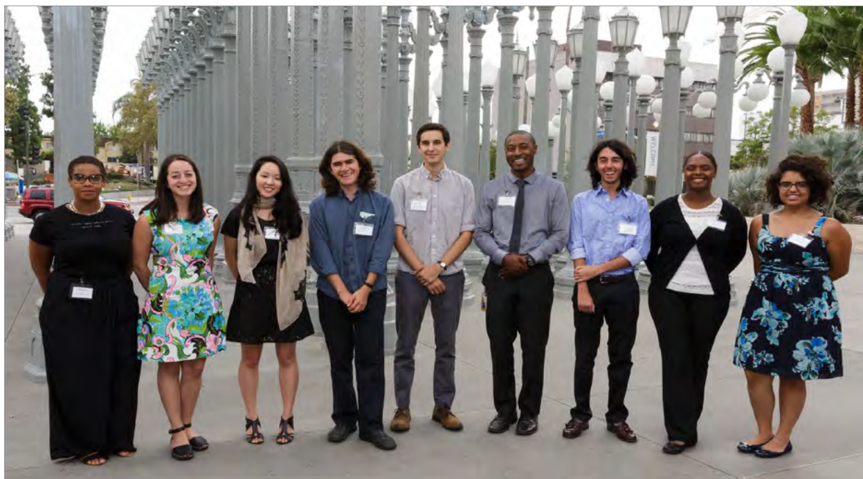
Group photo of the first class of Mellon Undergraduate Curatorial Fellows in front of Urban Light by Chris Burden at the Los Angeles County Museum of Art.