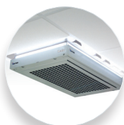
Simple to use and operate

Demand the best, industry certified, filtration quality.